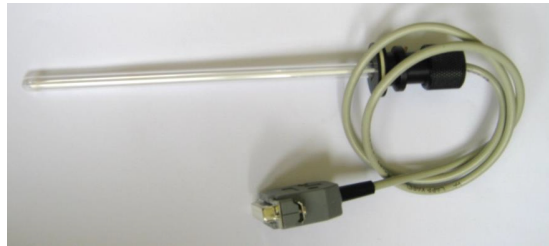
Figure 1: Temperature sensor